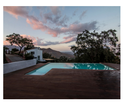
Ref.-ID: R2379206 La Mairena