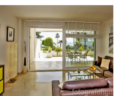
Estepona Ref.-ID: R2602205 Apartment