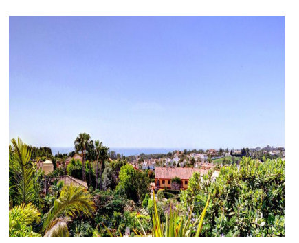
Ref.-ID: R2814137 The Golden Mile House

Community: 4,404 EUR / year IBI: 4,664 EUR / year