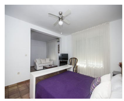
Ref.-ID: R2980193 Benalmadena Pueblo