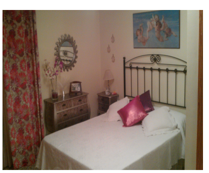
Ref.-ID: R3169777 Estepona Apartment