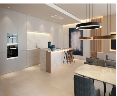
La Quinta Ref.-ID: R3545281