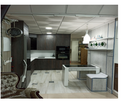
Ref.-ID: R3902653 Marbella Commercial