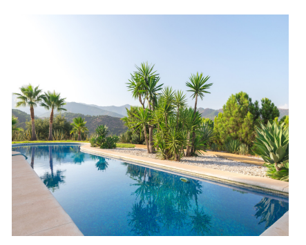
Ref.-ID: R3911800 Estepona