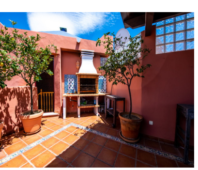
Ref.-ID: R4016782 New Golden Mile Apartment