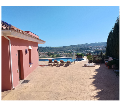
Ref.-ID: R4060060 Mijas Golf House