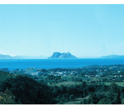
Ref.-ID: R4258579 New Golden Mile Plot