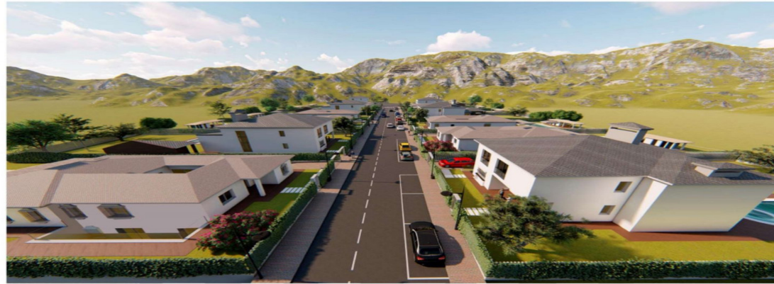
Ejemplo de barrio, zona este