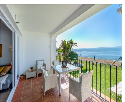
Ref.-ID: R4359592 Mijas Costa Apartment