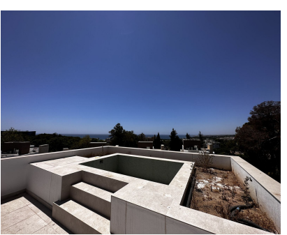
Ref.-ID: R4441894 The Golden Mile