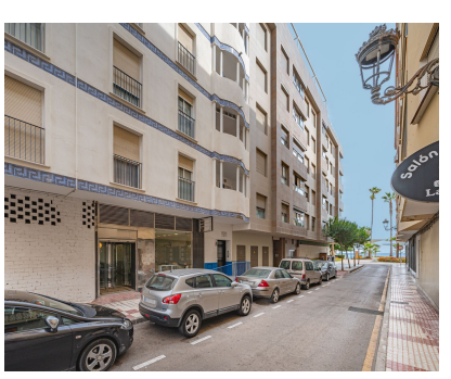
Ref.-ID: R4443310 Estepona Commercial