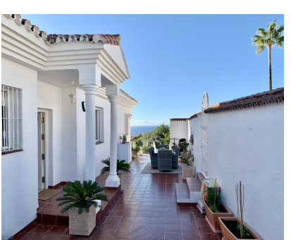
Ref.-ID: R4453837 Mijas House

Community: 1,440 EUR / year IBI: 1,241 EUR / year