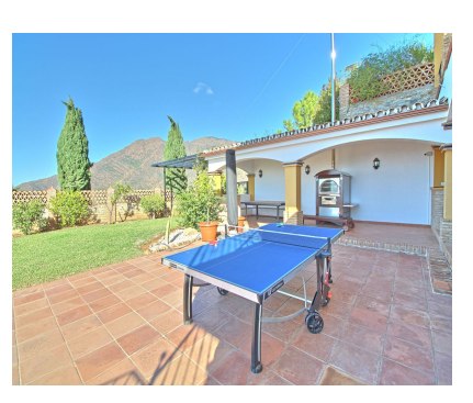
Ref.-ID: R4502134 Estepona