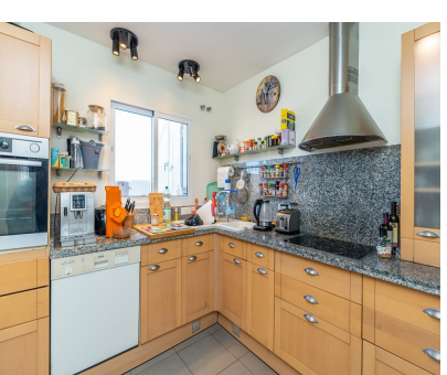
Ref.-ID: R4566769 Marbesa Apartment