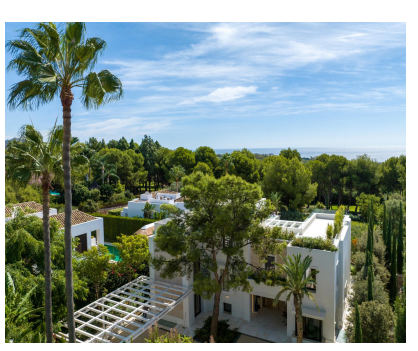
Ref.-ID: R4568479 The Golden Mile House