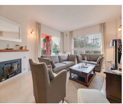
Ref.-ID: R4581976 Elviria Apartment

Community: 6,060 EUR / year IBI: 1,231 EUR / year