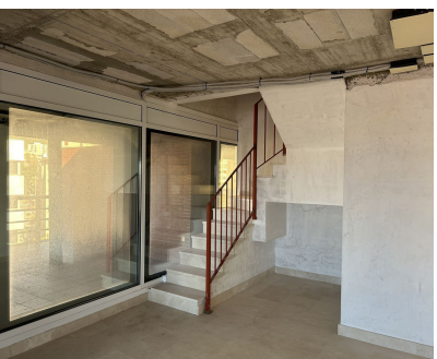
Ref.-ID: R4583257 Marbella Commercial