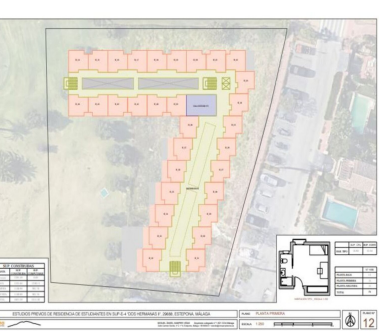
Ref.-ID: R4600666 Estepona Plot