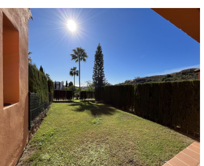
Ref.-ID: R4619707 Benahavís House

Community: 2,880 EUR / year IBI: 880 EUR / year