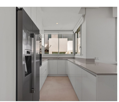
Benahavís Ref.-ID: R4630615