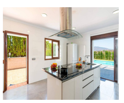
Ref.-ID: R4640161 Sierrezuela