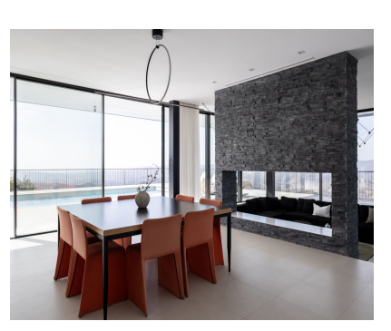
Ref.-ID: R4643515 Valtocado House