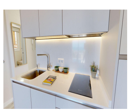
Ref.-ID: R4662202 Calahonda Apartment