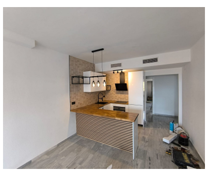
Ref.-ID: R4678303 Cabopino Apartment