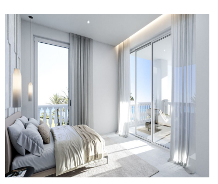
Ref.-ID: R4681855 Estepona Apartment