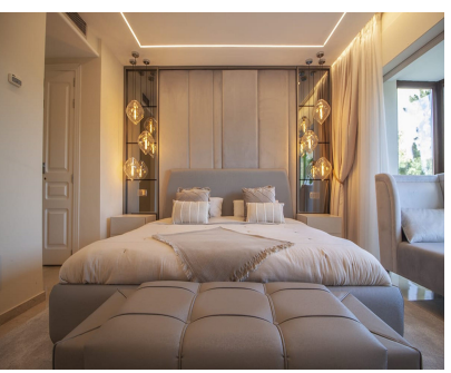
Ref.-ID: R4704691 Río Real House