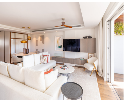
The Golden Mile