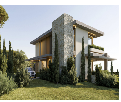
Ref.-ID: R4716412 Istán Plot