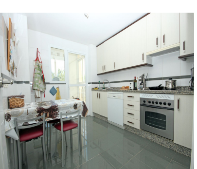
Ref.-ID: R4719094 New Golden Mile Apartment