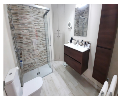
Apartment Ref.-ID: R4719547 Mijas Golf