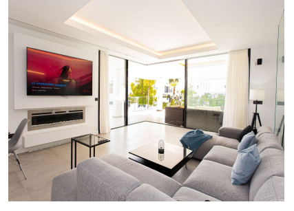
Ref.-ID: R4724944 Ma