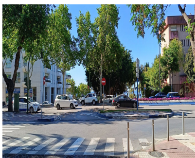
Ref.-ID: R4730671 Marbella Commercial

Community: 300 EUR / year IBI: 400 EUR / year Rubbish: 80 EUR / year