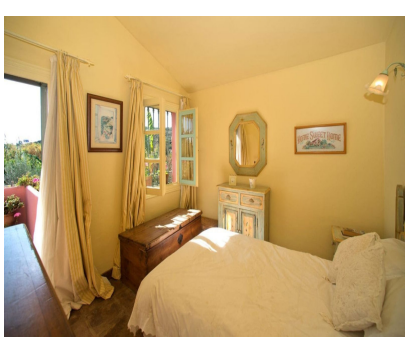
Ref.-ID: R4732207 Estepona

IBI: 503 EUR / year Rubbish: 185 EUR / year