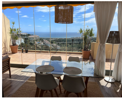
Ref.-ID: R4742587 Calahonda Apartment