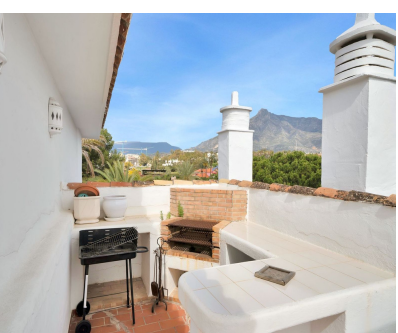
Ref.-ID: R4747999 Marbella Apartment