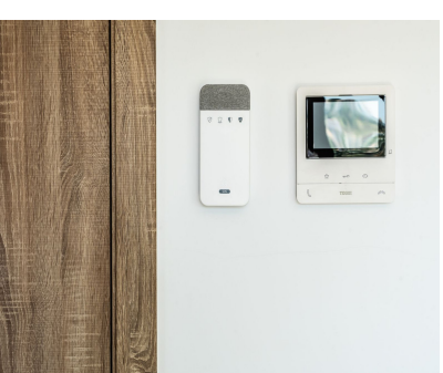
Ref.-ID: R4749433 La Cala Golf Apartment