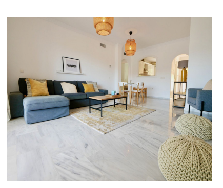
Ref.-ID: R4749688 Calahonda