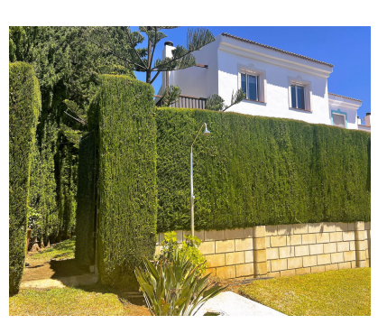
Ref.-ID: R4752751 Mijas House