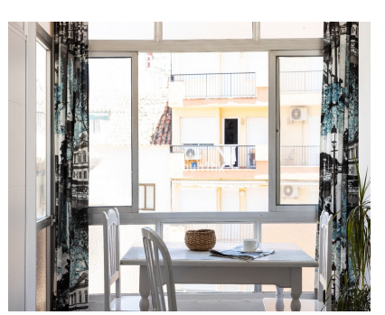
Ref.-ID: R4754443 Fuengirola Apartment