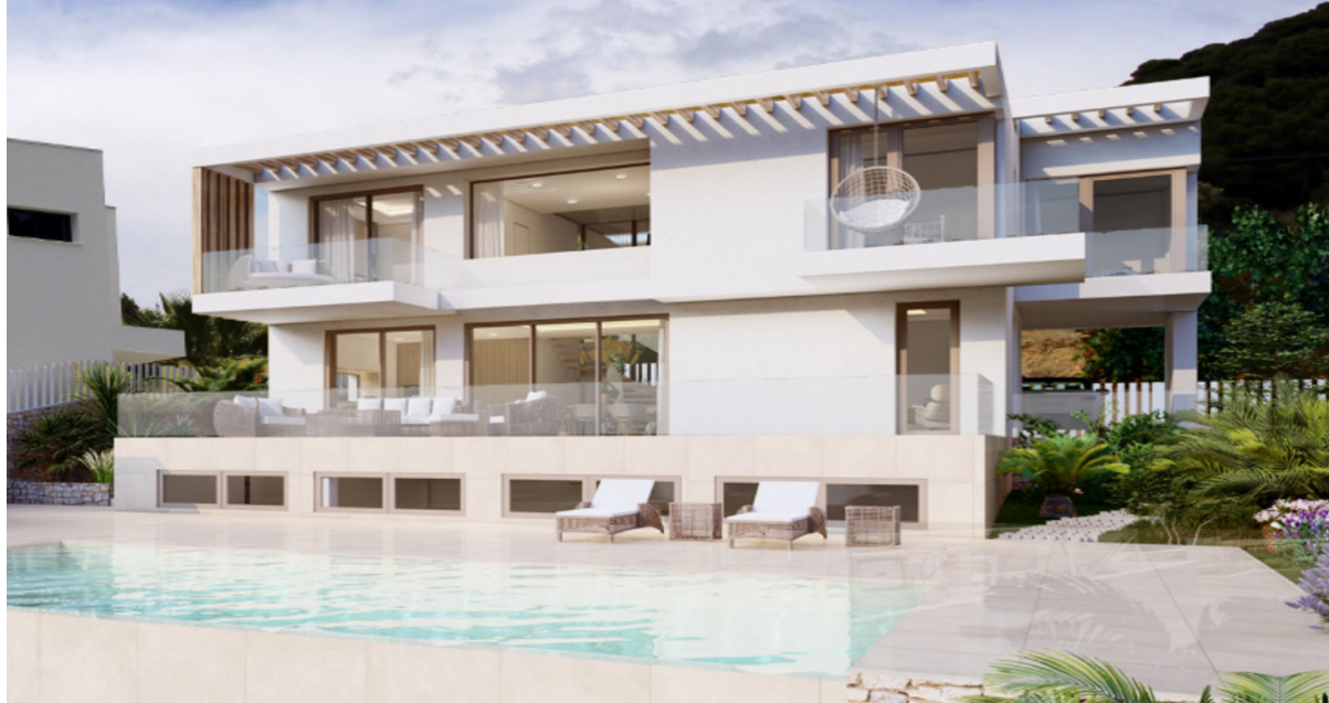
Ref.-ID: R4761079 Mijas House