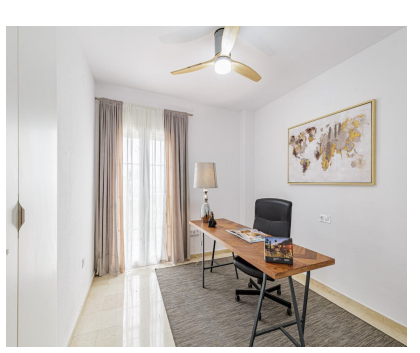
Fuengirola Ref.-ID: R4763518 Apartment