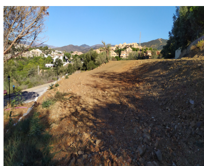
Ref.-ID: R4778695 Marbella Plot