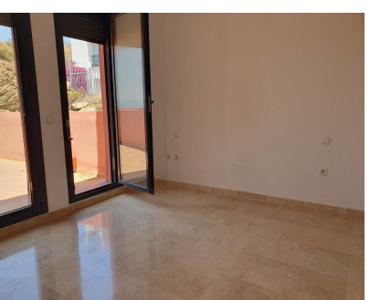
Ref.-ID: R4780870 Calahonda Apartment