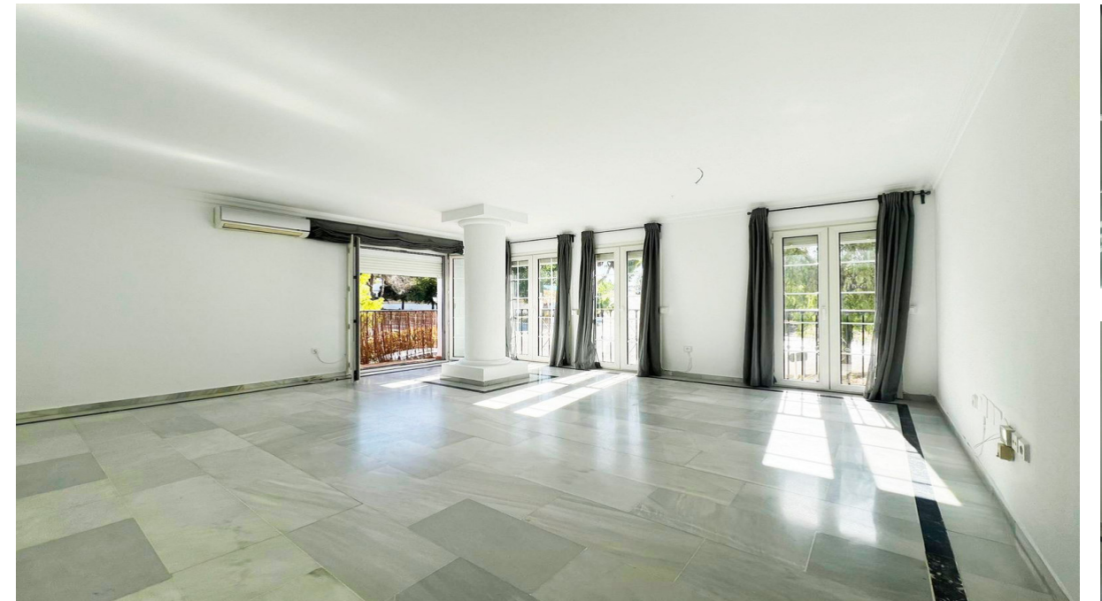
Mijas Costa Apartment