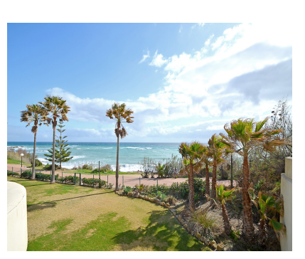
Ref.-ID: R4786675 Estepona Apartment