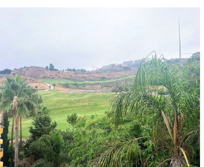
Ref.-ID: R4788190 Calanova Golf Apartment